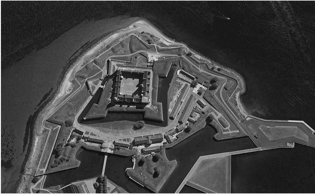
Figure 12.3 Aerial photograph of Kronborg castle, 2014.