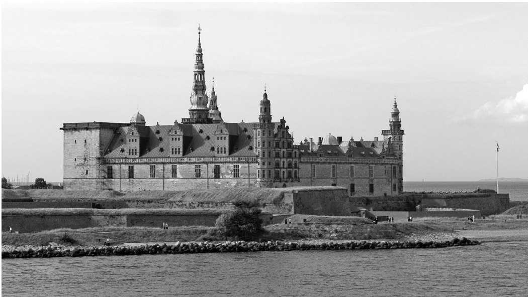
Figure 12.4 Sea-level photograph of Kronborg castle, 2007. Wikimedia Commons.

the opening scenes of Hamlet and the castle as they might expect to see it based on the Braun and Hogenberg image. Rather than a source for Shakespeare's Elsinore in any direct fashion, it is possible instead that these images served as a spur—if the playwright or his companions were aware of the existence of the plate, and their relative inaccuracy could be confirmed by the members of the company who had visited the castle,