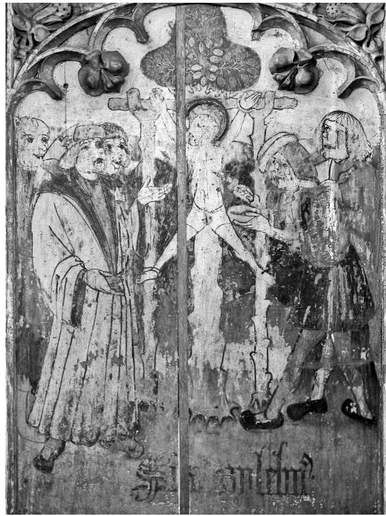
143. A fifteenth-century painted rood screen depicting the ritual murder of St. William of Norwich. Holy Trinity Church, Loddon, Norfolk.

The Blood Libel and ritual murder accusations drew on and fused with earlier associations between the Jews and sorcery. Readers of the Old Testament knew that Moses and Aaron had freed the Israelites by besting the Egyptian sorcerers, and Joseph was adept at interpreting dreams – a service that Jews were known to sell in Roman times, as the epithet qualiacunque voles Iudaei somnia vendunt ("The Jew will readily sell you any dream") in Juvenal's Satires makes clear. The medieval belief that the Jews were in league with the devil explained their perceived magical abilities and equated Jewish ritual with demonic magic in the popular Christian mind.