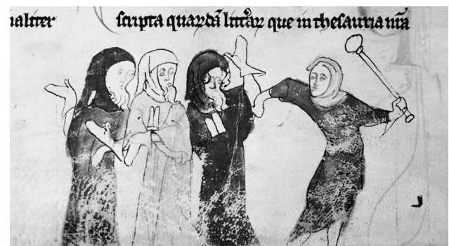
141. The persecution of English Jews. Marginal drawing in Chronica Roffense , Rochester, early fourteenth century. British Library MS Cotton Nero D. II, fol. 183v.

The belief that Jews were horned, visually reinforced by the horned Jewish hat they were required to wear, may have also derived from the common iconographic representation