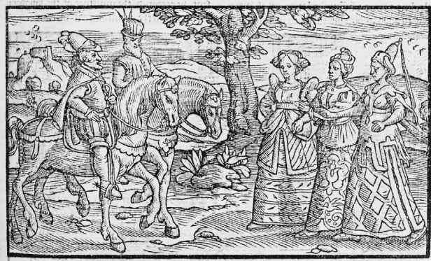
144. Macbeth and the Witches, Raphael Holinshed, Chronicles of England, Scotland, and Ireland (London: 1577).

BY THE TIME SHAKESPEARE CREATED his three weird sisters for Macbeth about 1606 (see Figure 144), the witchcraft hysteria in Europe had already waxed and waned a number of times. England’s spectacular and melodramatic trials had only recently begun, as England before Elizabeth I had been relatively free of this particular cultural plague. The playwright would have had a wealth of information by the turn of the century from pamphlets and other popular accounts of trials from Italy to Scotland. Sadly, after the death of William Shakespeare, the seventeenth century was to witness one of the fiercest and bloodiest periods in this dismal chapter of European history, and many of these later trials would be held in England.